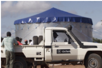
Tank Roof kit, PVC