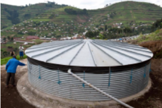
Tank Roof kit, Steel