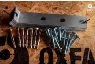
Anchor Bolt Kit, Steel Tanks